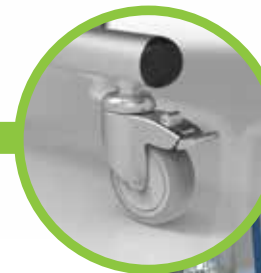
Heavy-duty locking caster.

Available in 48" and 60" round tops in standard height and pub height.