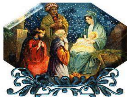
Jan. 8 th - 10:00 a.m. - Epiphany Sunday The Wise Men Enter

Scriptures for next Sunday –Psalm 72:1-7, 10-14 & Matthew 2:1-12