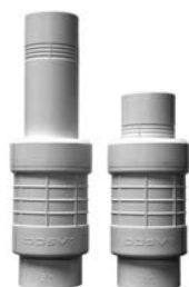
Slip x Spigot