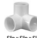
Slip x Slip x Slip