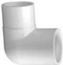
SP x Slip