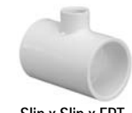
Slip x Slip x FPT