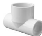
Slip x Slip x Slip