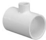
Slip x Slip x Slip