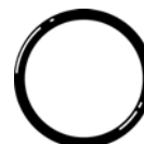
Buna-N (Nitrile) (Current style)

Pressure rated at 150 p.s.i. at 73.4°F. Unions are listed as NSF 61