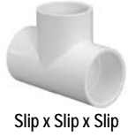
Slip x Slip x Slip

KEY: FPT.....Female Pipe Thread SLIP.....Solvent Cement Socket MPT.....Male Pipe Thread SP.....Spigot