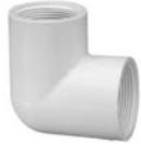
FPT x FPT

KEY: FPT.....Female Pipe Thread SLIP.....Solvent Cement Socket MPT.....Male Pipe Thread SP.....Spigot