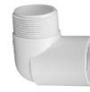
MPT x FPT