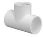
Slip x Slip x FPT