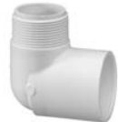
MPT x Slip