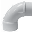
Slip x SP