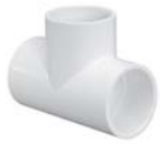
Slip x Slip x Slip