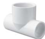
Slip x Slip x Slip