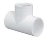
Slip x Slip x FPT