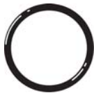
Buna-N (Nitrile) (Current style)