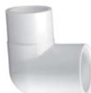
SP x Slip