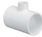
Slip x Slip x Slip