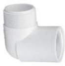
MPT x FPT