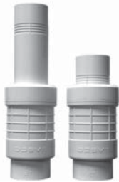
Slip x Spigot