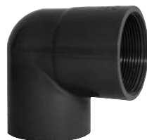
(Socket x Female ACME)