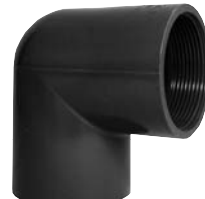
Female ACME x Female ACME