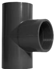
(Socket x Socket x Female ACME)