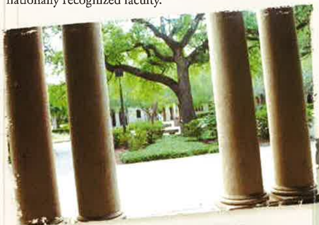
View of LSU Quad

Extensive evaluations of each faculty member are conducted to assure that the most current and effective teaching techniques are employed in the classroom. The School's informal learning environment provides the student ample opportunities to discuss banking topics with its nationally recognized faculty.