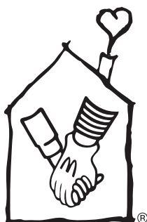
RONALD McDONALD HOUSE CHARITIES MEMPHIS