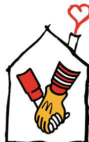
RONALD McDONALD HOUSE CHARITIES® MEMPHIS